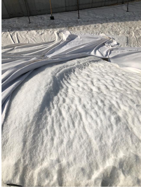
Figure S2. Difference on the southwest side of the snow pile between covered and uncovered on 7 February 2022 at the Big Air Shougang.