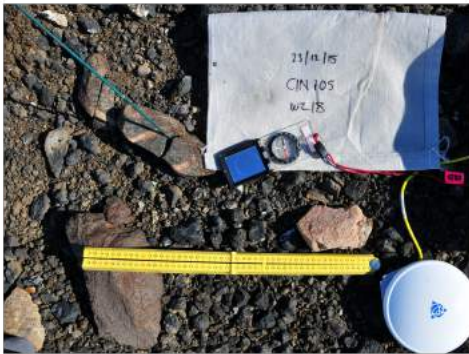
CIN-105 7.1 \pm 0.5 ka