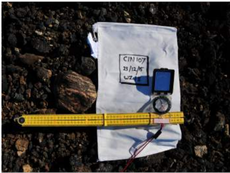
CIN-107 6.9 \pm 0.4 ka