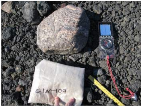
CIN-109 6.2 \pm 0.4 ka