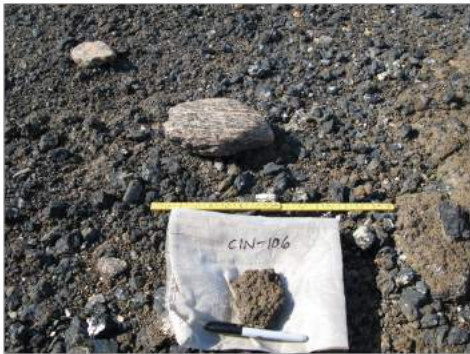
CIN-106 6.9 \pm 0.5 ka