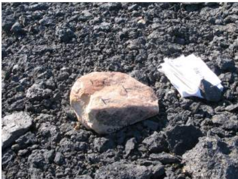
CIN-110 6.5 \pm 0.4 ka