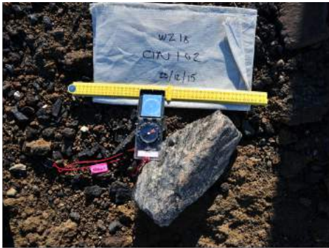
CIN-102 7.5 \pm 0.5 ka