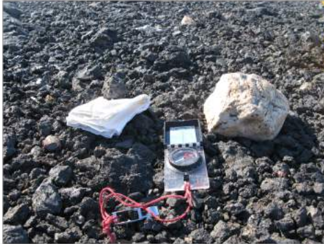
CIN-112 6.6 \pm 0.4 ka