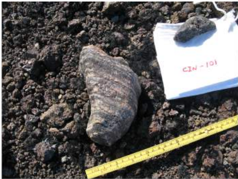
CIN-101 7.4 \pm 0.5 ka