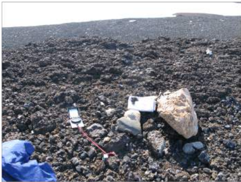
CIN-104 7.0 \pm 0.5 ka