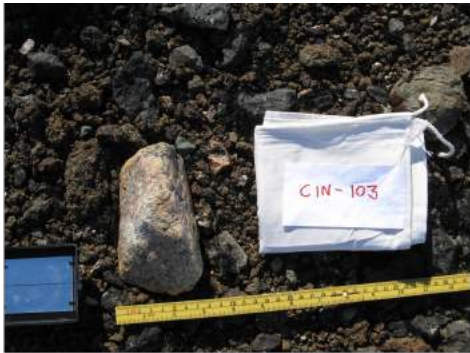
CIN-103 6.7 \pm 0.5 ka