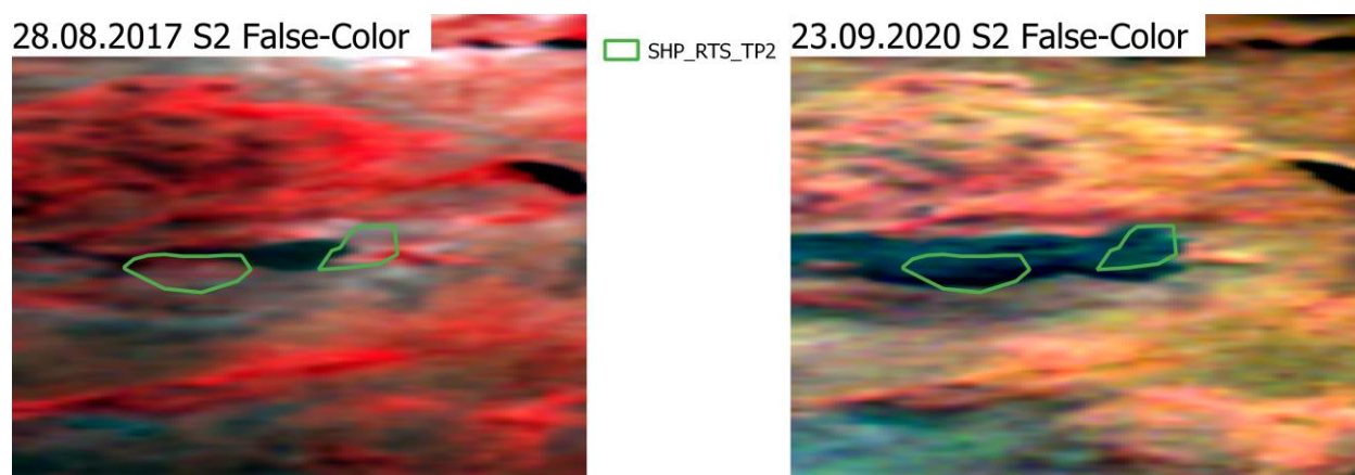
Figure 3: Left: Sentinel-2 False color image taken on 28.08.2017 (before the first dem), Right: Sentinel-2 False color image taken on 23.09.2020 (end of summer before second DEM)