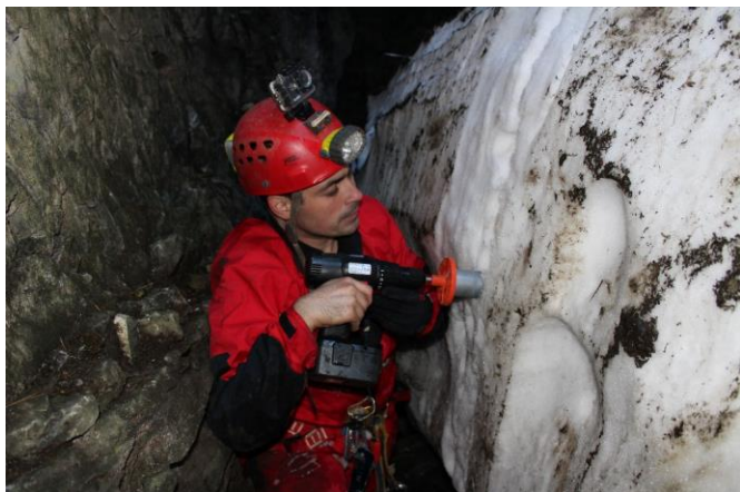
65 Figure 2. Sampling location and procedure, in the Christaki Pothole.

On 23rd of September 2017, forty-one (41) ice samples were collected from the Christaki Pothole. Each sample was collected from a 2 m high section (Figure 2), with a portable cup drill of 5cm diameter and about 2-3 cm depth, resulting in samples of 30 to 40 cm 3 , at 5 cm intervals and spanning from the top of the ice section to the cave floor. Samples with odd numbering were selected for tritium content determination. Measurements were performed at the Archaeometry Center of the University of Ioannina.