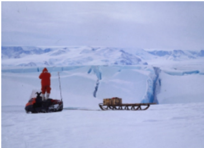
Fig. C2. Ice wedge on Larsen A Ice Shelf, located several km inland of the front (left). Cracks near the ice front (right). Photos H. Rott, 24 Oct. 1994.