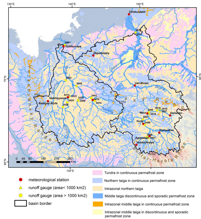
Fig. 1. Landscape distribution within the study basins according to Permafrost-Landscape Map of the Republic of Sakha (Yakutia) on a Scale 1:1,500,000 (Fedorov et al., 2018)