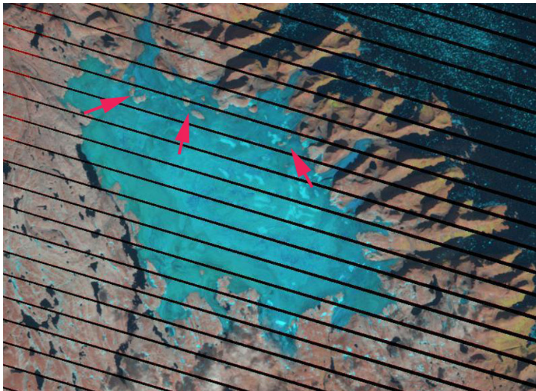
Fig. 1. August 7, 2012 Landsat 8 image of Grinnell Ice Cap, red arrows indicate expanding nunatak areas. The lack of snowcover also apparent.