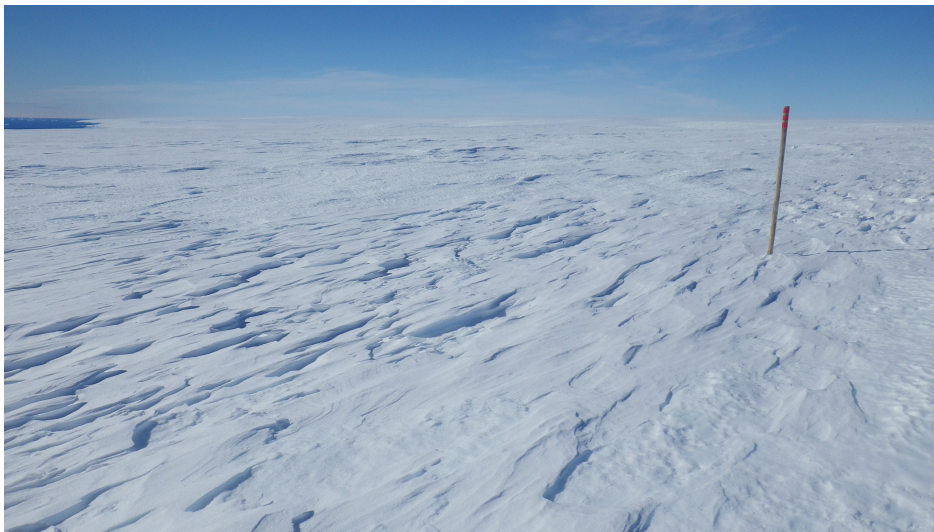
Fig. 2. Photograph of the sastruged snow surface at D17 on 11 February 2013. The stake is 2 m in height.