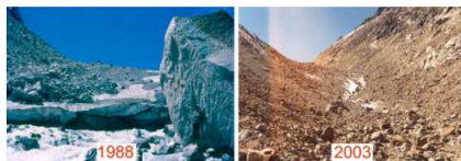
Figure 6. Field photograph of terminus region of Chhota Shigri glacier, Lahaul and Spiti district, of HP taken in 1988 and 2003. In 1988, glacial ice is exposed on the surface and small portion of the terminus is covered by debris. By year 2003, the entire terminus zone is covered by debris.

Figure 6 from Kulkarni et al., Current Science , 2007