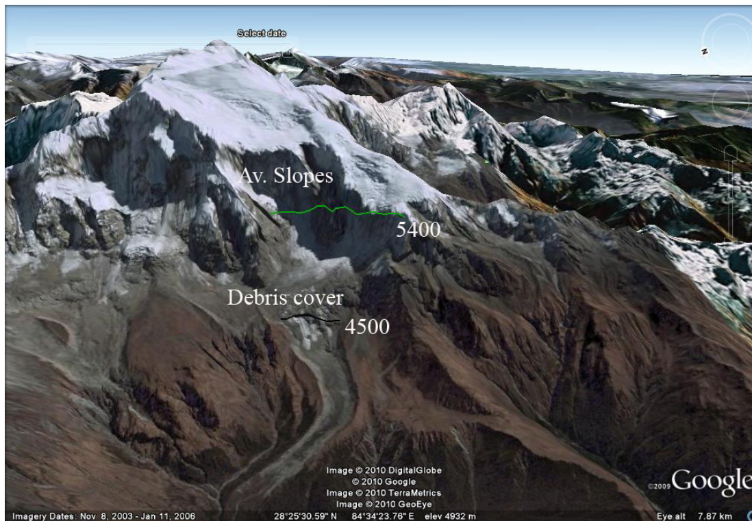
Fig. 3. Glacier draining the east flank of Manaslu Peak, Nepal. Complete debris cover beneath the avalanche slopes of the east face.