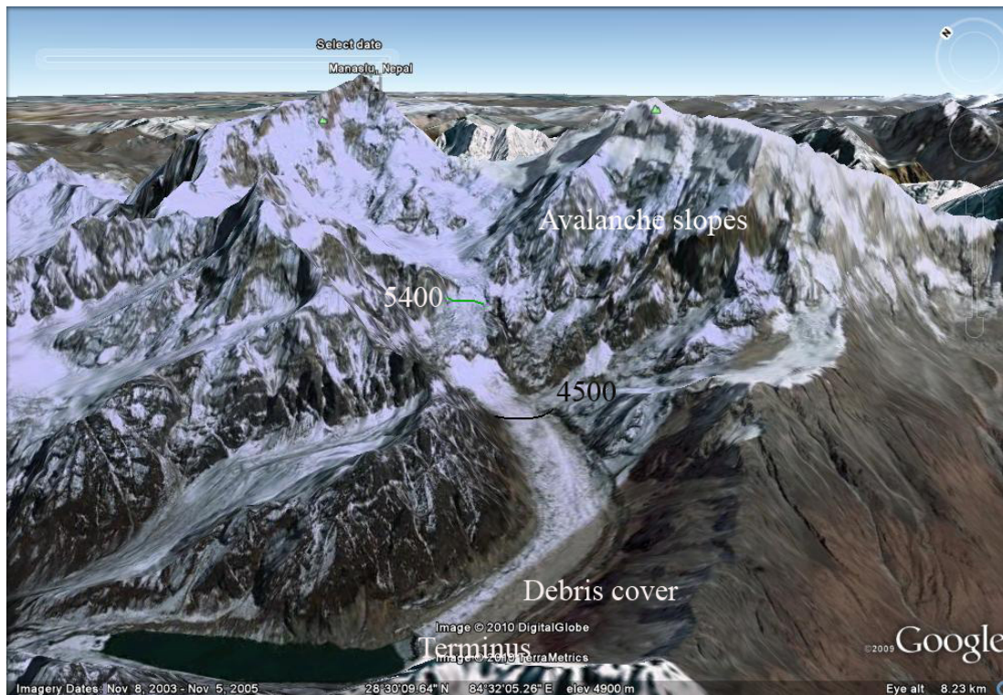
Fig. 1. Thuleg Glacier on Manaslu, the entire glacier below 4500 meters is debris covered, though new snowfall covers some of this.