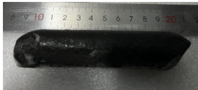
(c) cut along the profile plane