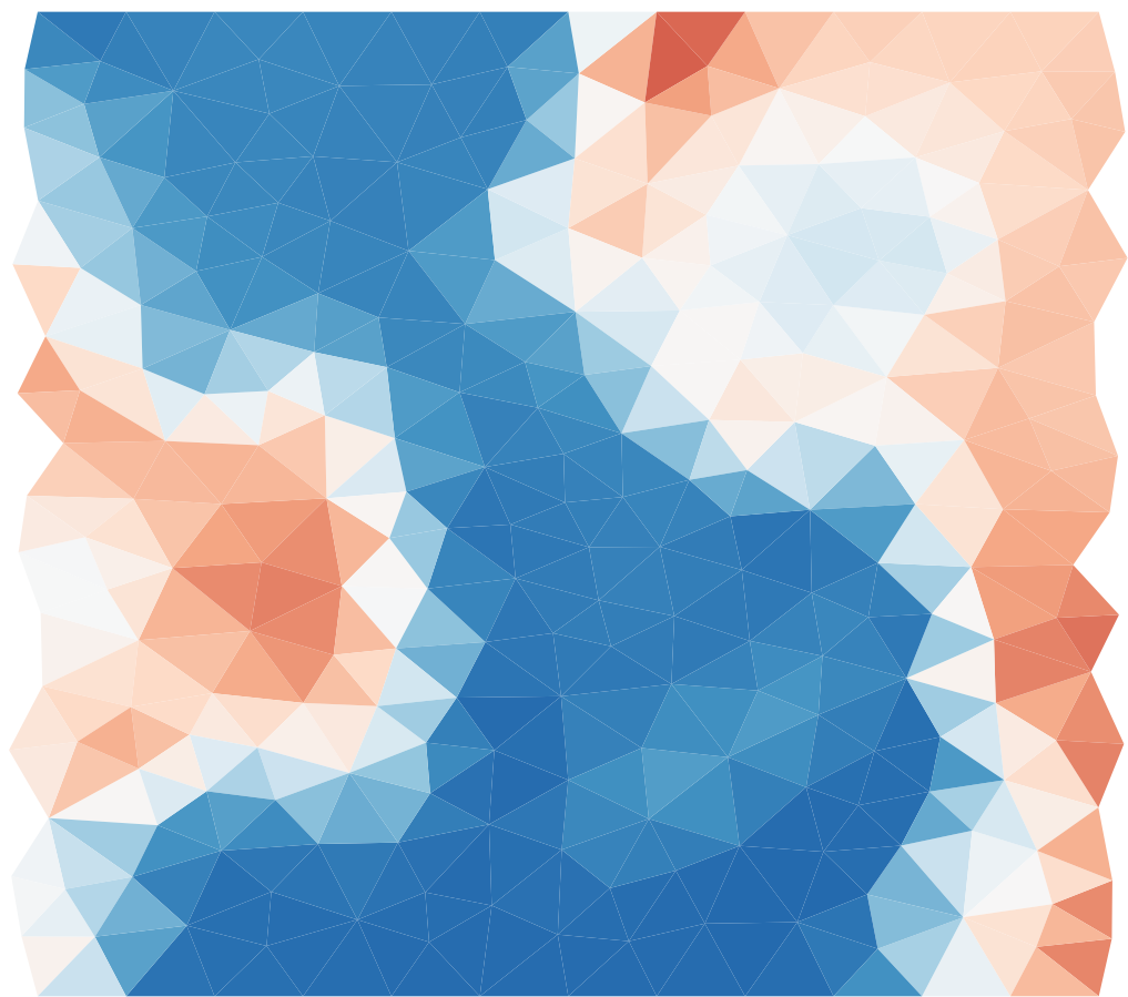
(c) \text{Corr}(v, \alpha) day 17