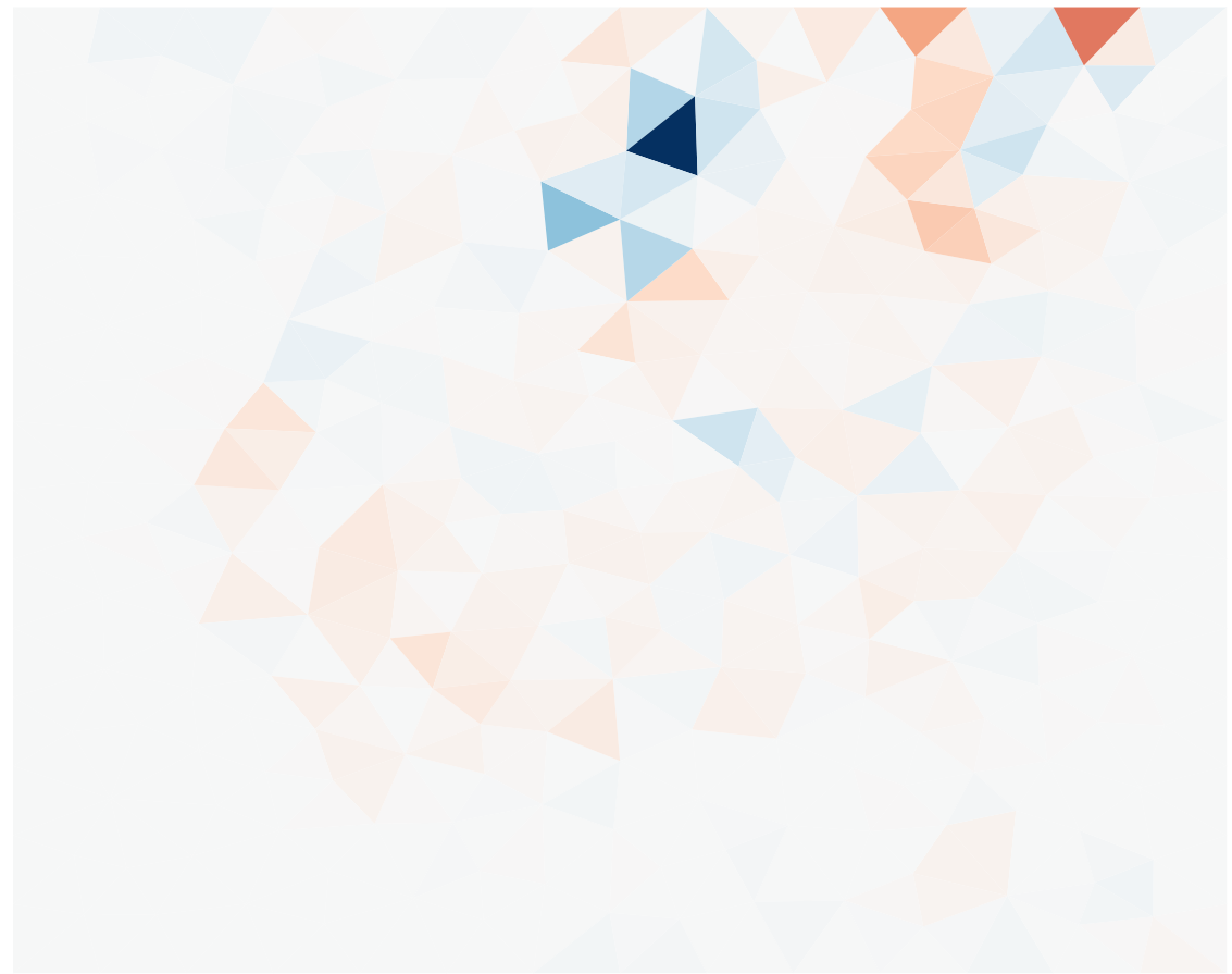
(b) SIC increment