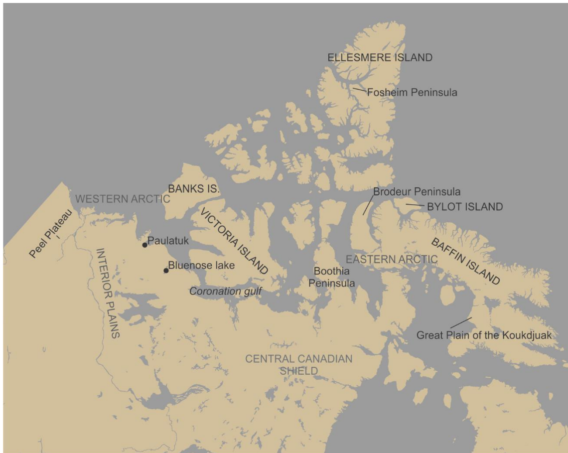
Figure S3. Locations referred to in text.